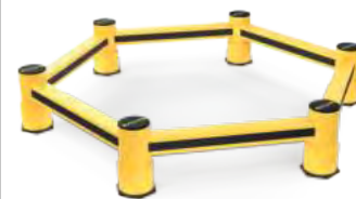
» IR Column Barrier Hexagon