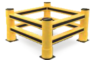
2R Column Barrier