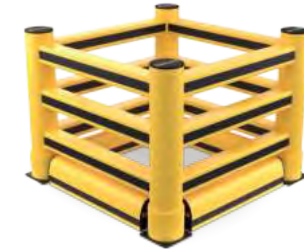
➤➤ 3R Column Barrier + KERB