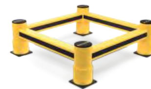
1R Column Barrier

Our column protection barriers, produced with flexible barrier technology, protect both vehicles and structures in the event of an accident, minimizing your possible costs.