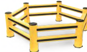
➤➤ 2R Column Barrier Hexagon