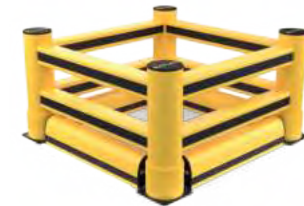
➤➤ 2R Column Barrier + KERB