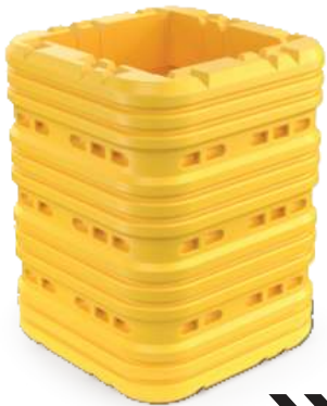
>>> POLYGUARD SUPREME

ELEVATE YOUR STANDARTS WITH OUR COLUMN BARRIERS