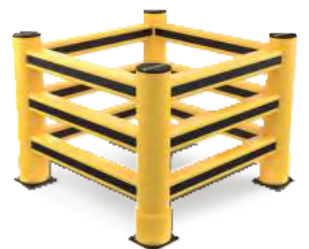
3R Column Barrier