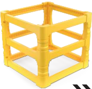
>>> POLYGUARD ETA