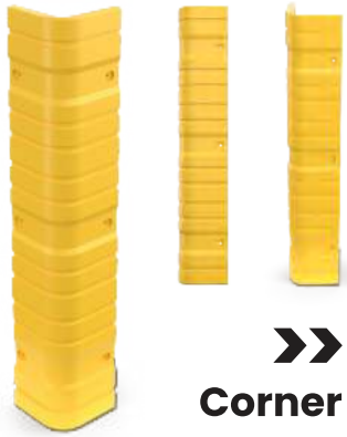
>>> Corner Protection