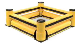
➤➤ 1R Column Barrier + KERB